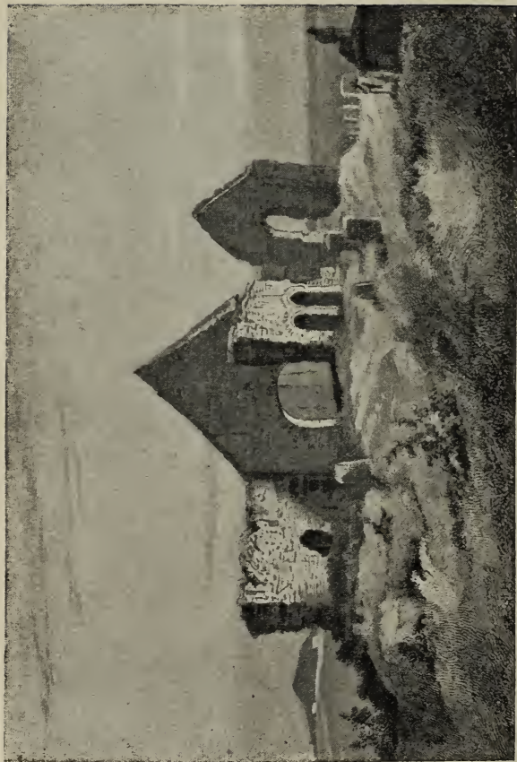
Remains of THE ABBEY OF KILBARRACK, CO. DUBLIN. THE SHAM SQUIRE'S TOMB (not now in existence) to the right.